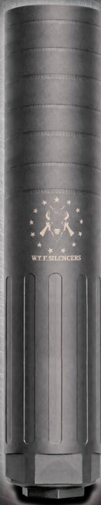
TATANKA LONG .36 & .416 CAL