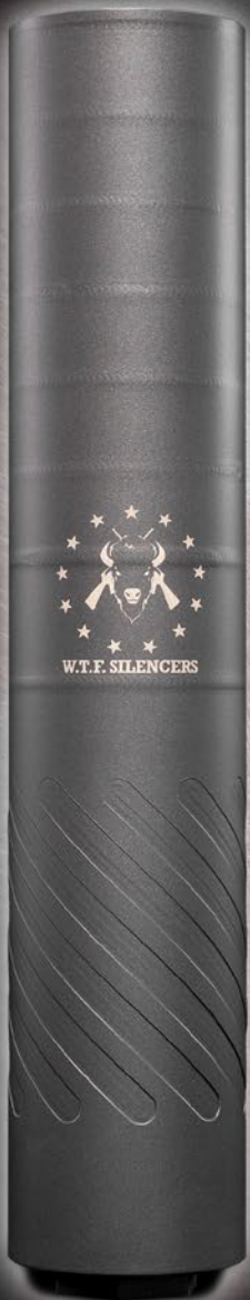
BARRON 50 CAL NON-BMG