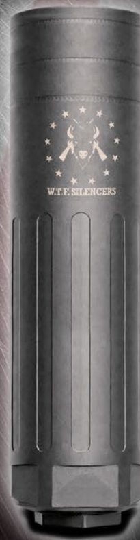
TATANKA SHORT .36 & .416 CAL