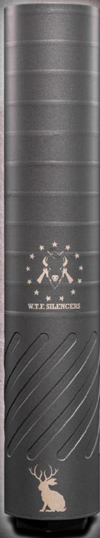
JACKALOPE .28 & .30 CAL